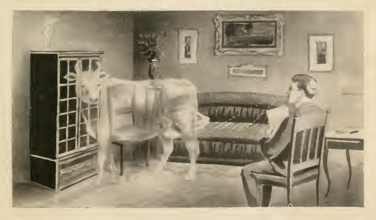
Hypnotized Man as a Stereopticon, throwing out an inspired environment.

Non-hypnotized Man as a Camera, receiving and registering a picture of his environment.