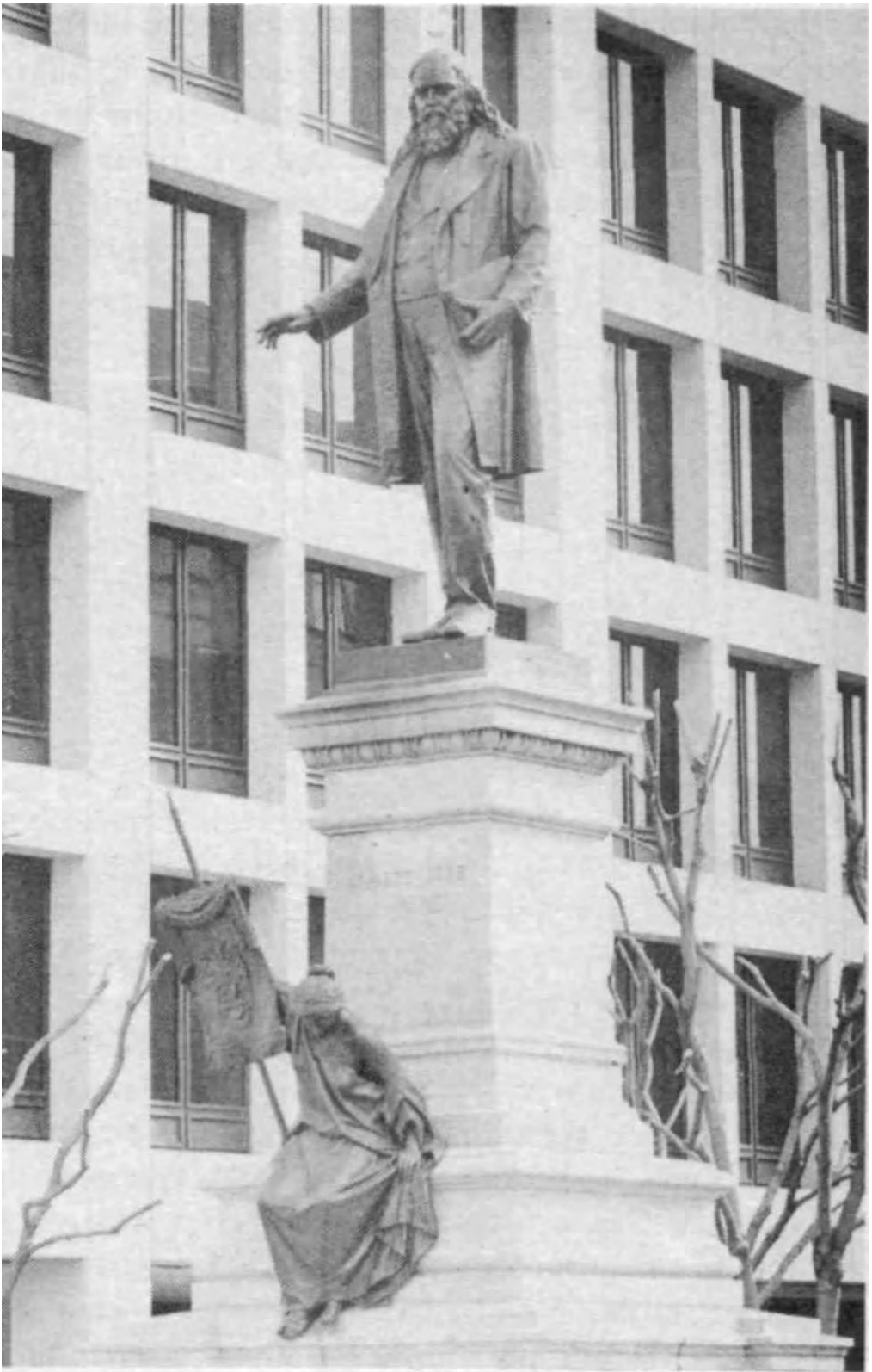
Scottish Rite Freemason and Ku Klux Klan founder Confederate Gen. Albert Pike's statue in Washington, D.C.'s Judiciary Square.