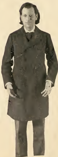
Your hands will drop to your sides.