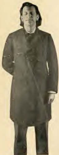
Allow them to remain closed.