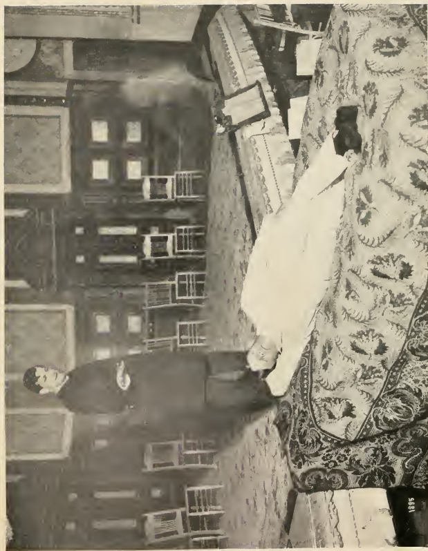
Kilmer during New York City Sleep at Hammerstein's Olympia, April 22 to 29, 1896.