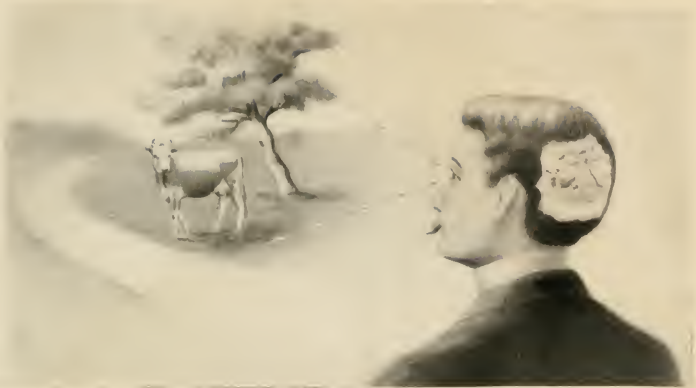
Non-hypnotized Man as a Camera, receiving and registering a picture of his environment.