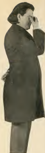
Or if I close them for you.