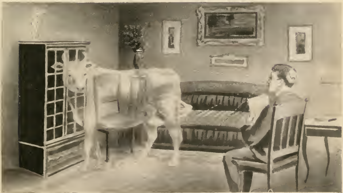
Hypnotized Man as a Stereopticon, throwing out an inspired environment.