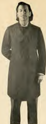
Will get heavy and close.