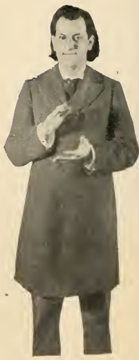
Will say "all right" and clap my hands.