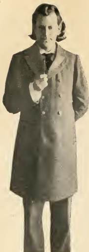
To look at the end of this pencil.