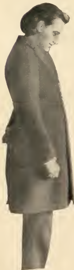
Your head will fall to the front.