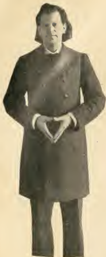
Put your hands together thus.