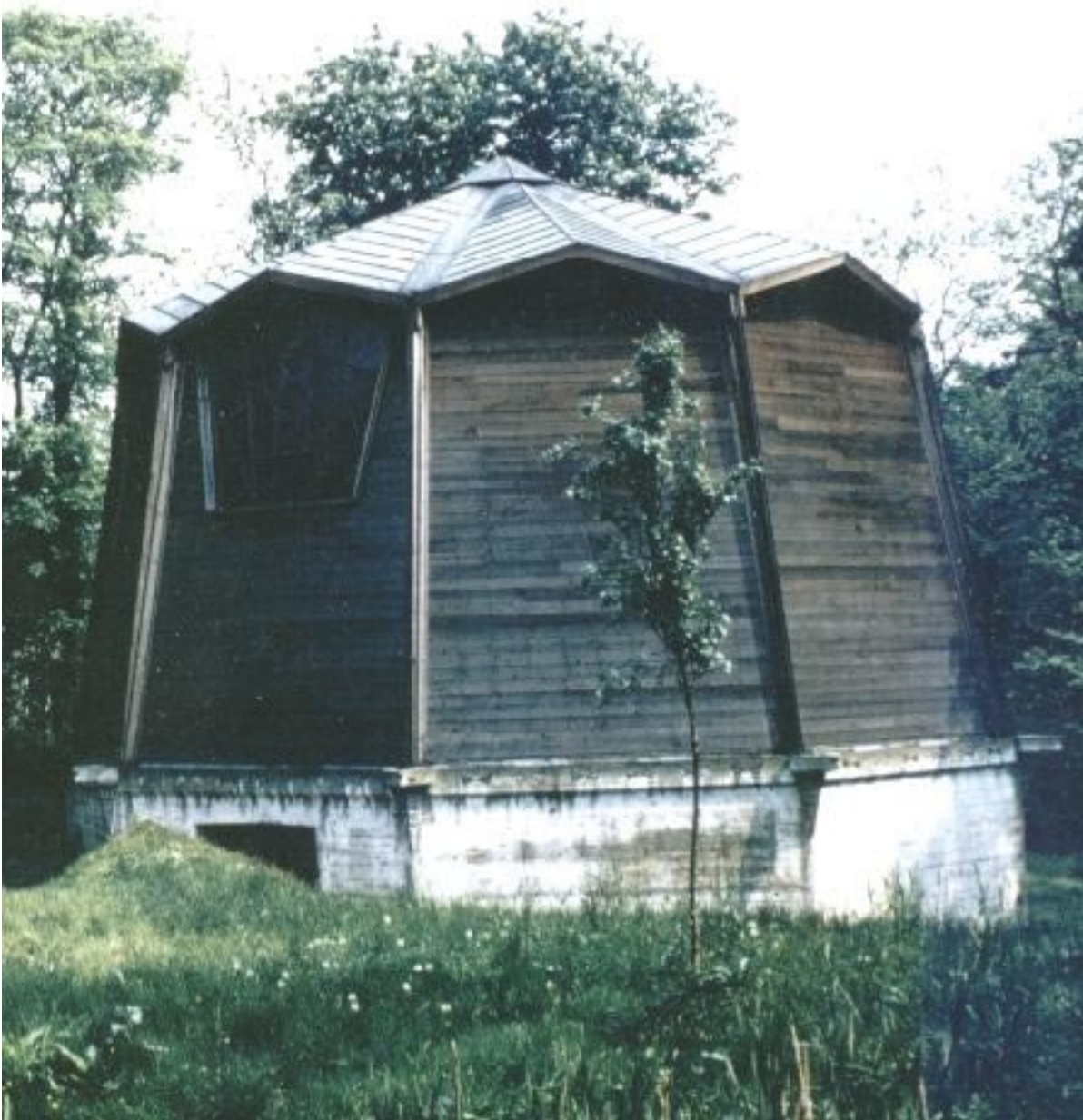
Djamichoonatra, the nine-sided building at Coombe Springs. Now demolished.