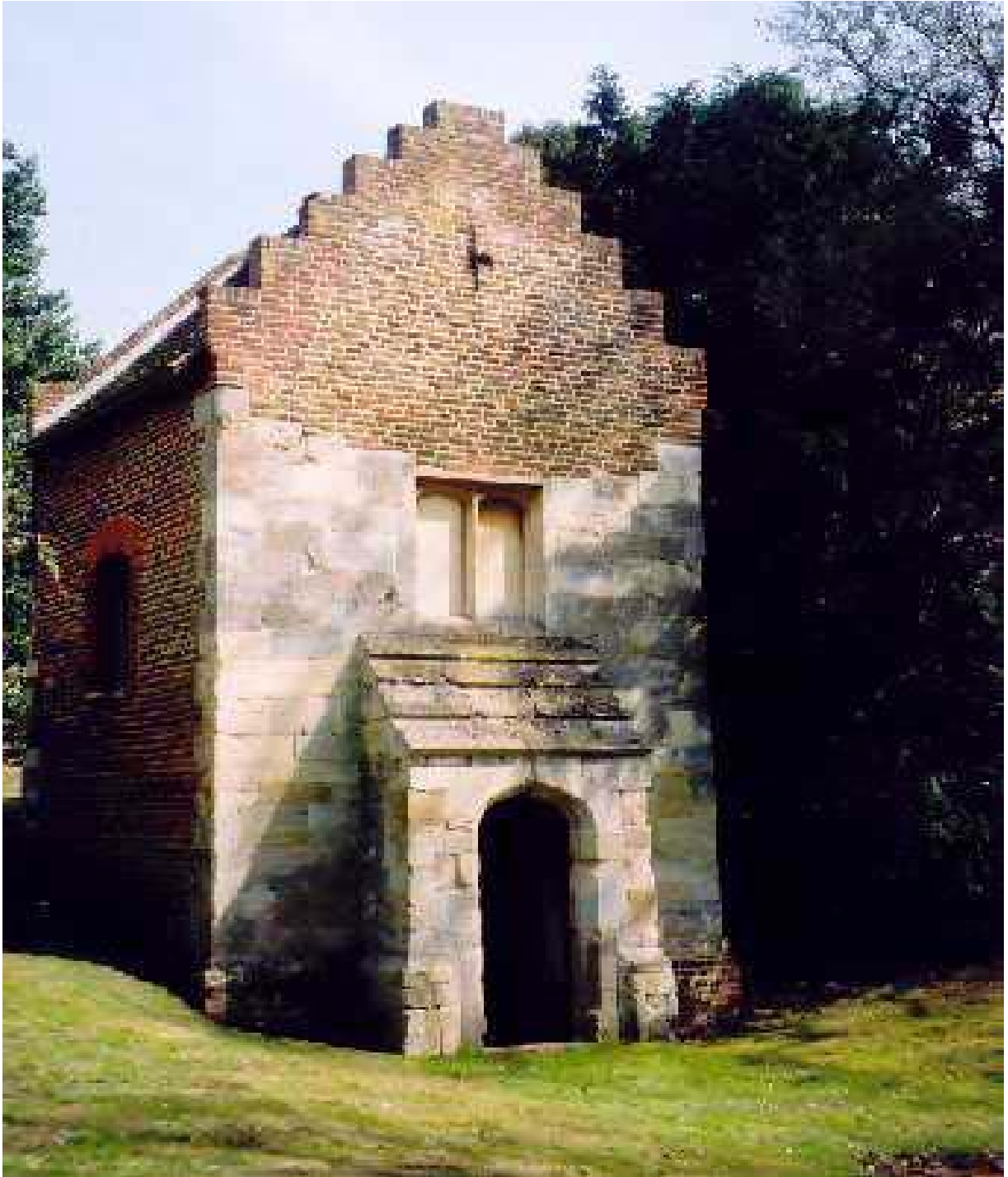
Cardinal Wolsey's Spring House, Coombe Springs