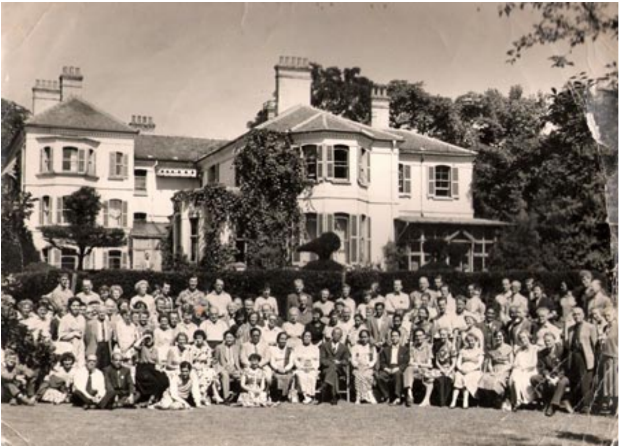
Subud World Congress, Coombe Springs, 1959