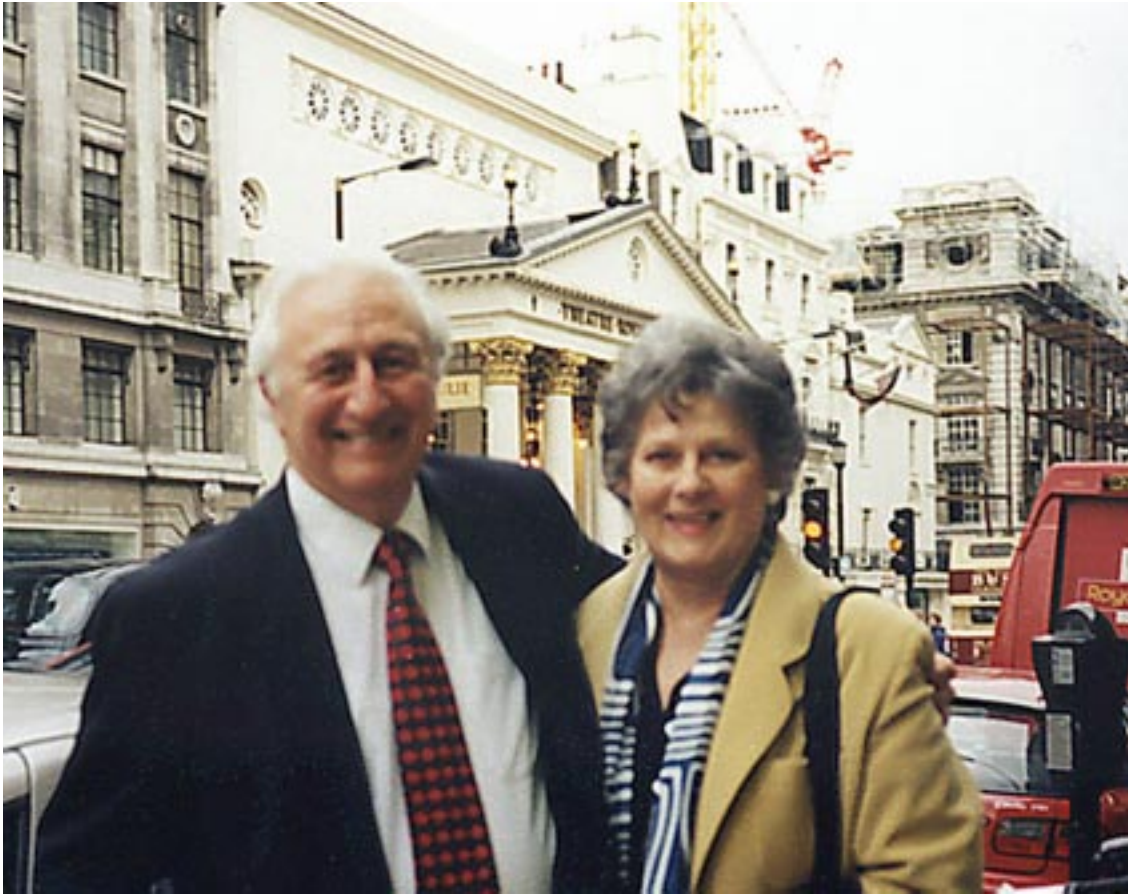
The author and wife on an anniversary jaunt to London